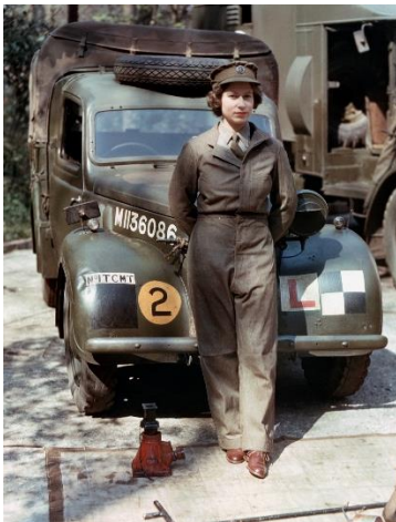
The Spitfire: IWM Photography Collection , ISBN 9781912423439, £12.99 The Royal Family in Wartime: IWM Photography Collection , ISBN 9781912423453, £12.99 Publication date May 2022