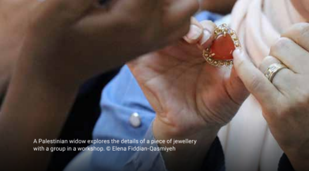
A Palestinian widow explores the details of a piece of jewellery with a group in a workshop.

The project explores the relationships between these communities and displaced people through interviews and participatory workshops, which are documented in an online 'Community of Conversation'.