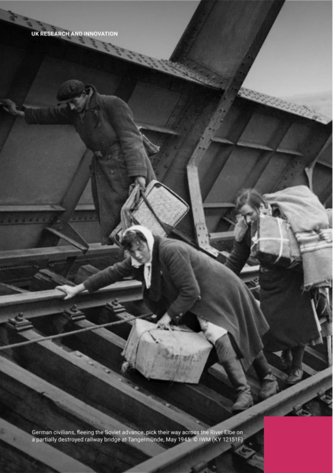
German civilians, fleeing the Soviet advance, pick their way across the River Elbe on a partially destroyed railway bridge at Tangermünde, May 1945. © IWM (KY 12151F)