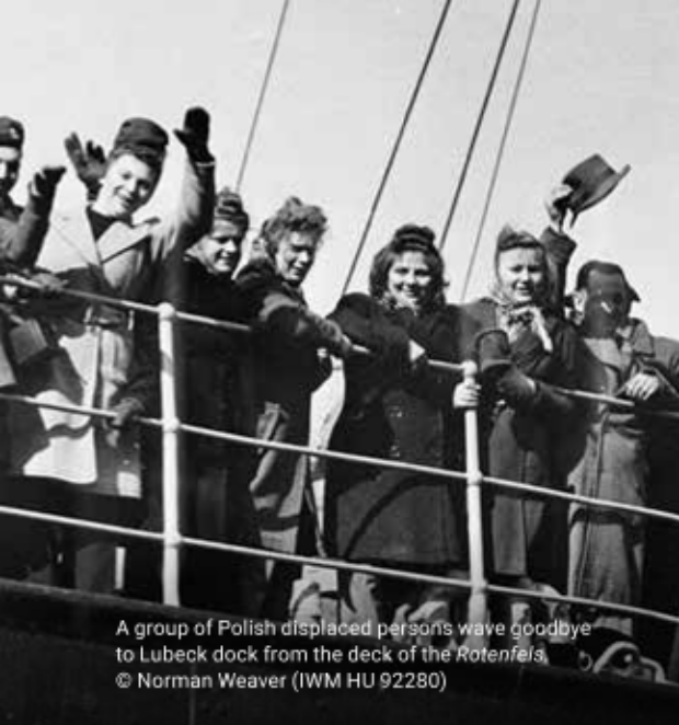
A group of Polish displaced persons wave goodbye to Lubeck dock from the deck of the Rotenfels .