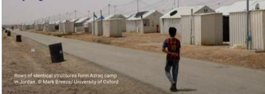
Rows of identical structures form Azraq camp in Jordan.

Much of the refugee experience is about waiting – for weeks, months and often years – so how people experience everyday life is crucial. Interviews with camp inhabitants at Berlin’s disused Tempelhof airport revealed how a lack of control over the mundane elements of life had the biggest impact on wellbeing.