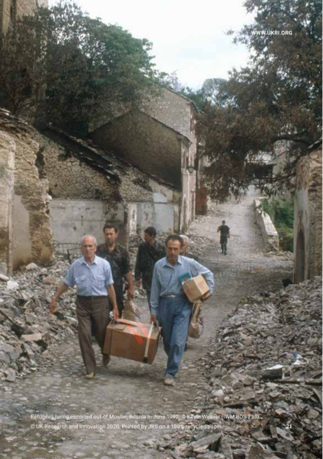
Refugees being escorted out of Mostar, Bosnia in June 1992.