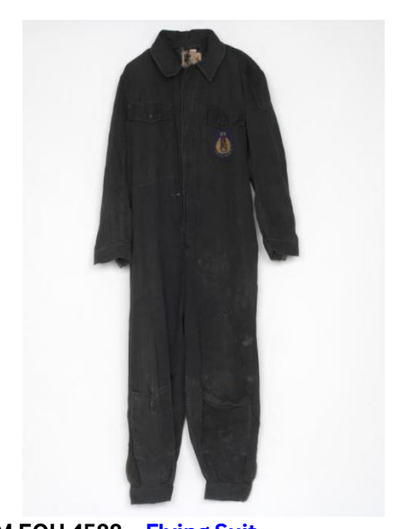
© IWM EQU 4588 – Flying Suit Available to film at IWM Duxford

Tamzine was the smallest vessel to participate in the Dunkirk evacuation and is now on display at IWM London. Originally intended to be a fishing boat, Tamzine was requisitioned for use in Operation Dynamo, the evacuation of the BEF from the beaches of Dunkirk, 27 May – 4 June 1940.