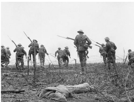
© IWM (Q 65408) Battle of the Somme. An infantry attack on the Somme