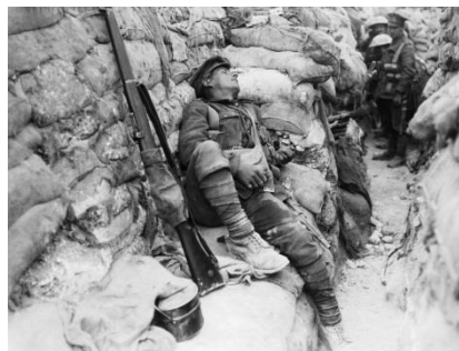
© IWM (Q 1071) The Battle of Thiepval. An exhausted soldier asleep in a front line trench at Thiepval, September 1916 – Battle of the Somme