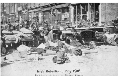
British troops man a street barricade in Dublin during the Easter Rising, April 1916