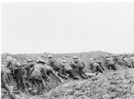
© IWM (Q 65406) Battle of the Somme. An infantry attack on the Somme